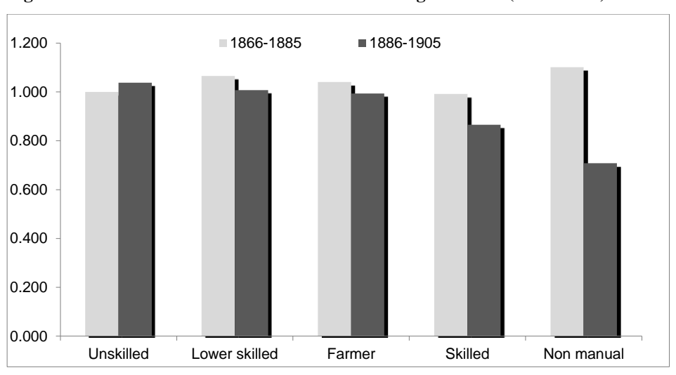
Figure 4: Interactions between SES and Marriage Cohorts (1866–1905)

Lastly, the relative risk of having another child was reduced (by about 10%) for the period corresponding with the First World War and Spanish flu. The results of the interaction with Model 2 (Table 4) show the SES differentials in the marriage cohorts. The non-manual workers experienced a notably significant reduction (40%) of the risk of having another child. These results are even more easily interpreted in the graph below (Figure 4).