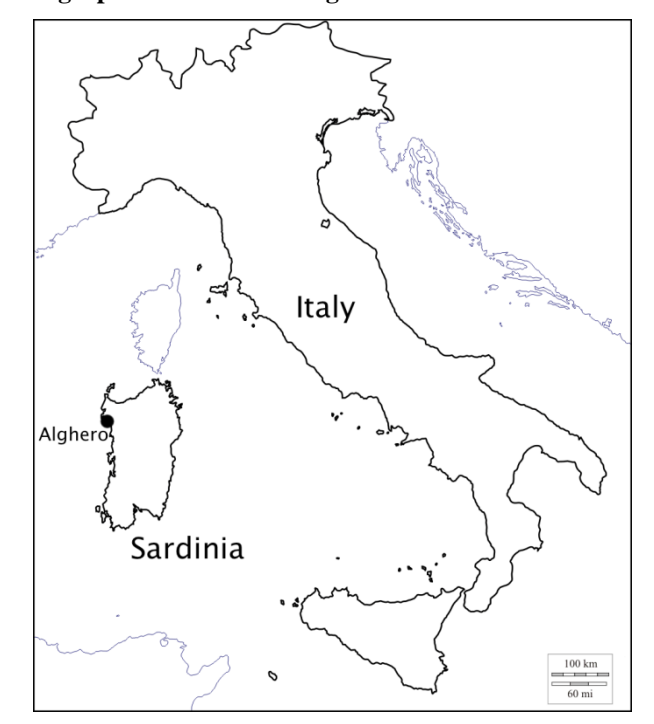
Figure 1: Geographical location of Alghero

The health status of Alghero's population was very poor, as seen by the extremely high incidence of (permanent and temporary) discharge of young men from military service, accounting for over 50% of the cohorts born between 1866 and 1900 at first enrolment (Breschi et al. 2011). Furthermore, conscripts from Alghero initially show a downward trend in physical stature up to 1870-1874, with mean height diminishing from 160.0 cm to 158.2 cm before stabilising at around 158 cm (Manfredini et al. 2013). Malaria was endemic, trachoma was also particularly widespread among children (Melis and Pozzi 2010), and tuberculosis was common (Tognotti 2012) – all clear signs of a continuous and enduring health "stress" afflicting the population.